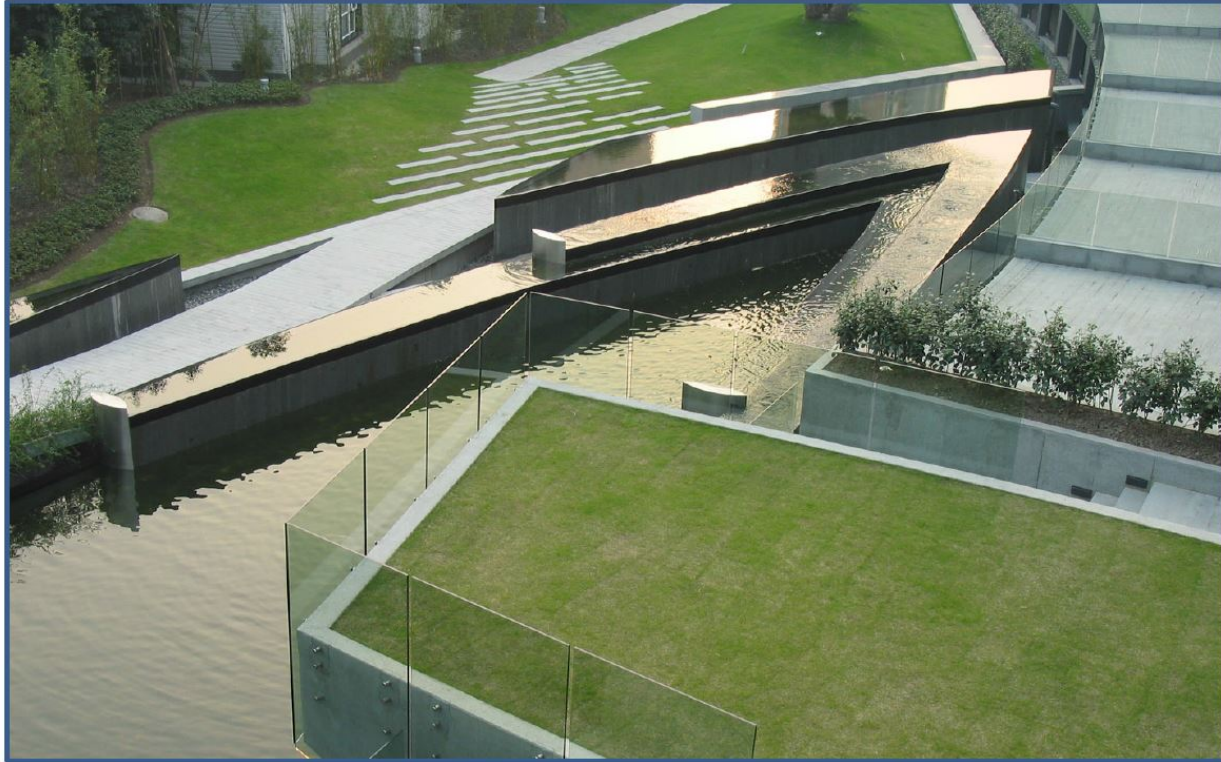
Aquino Image 01 Zobon Sculpture Garden ASLA National Honor Award, 2009

A cantilevered overlook and private rear terraces allow residents and visitors to engage the 'Sky Garden' reflecting pond. The pond system utilizes a combination of vegetation and organic filters to sustain an active koi fish population.