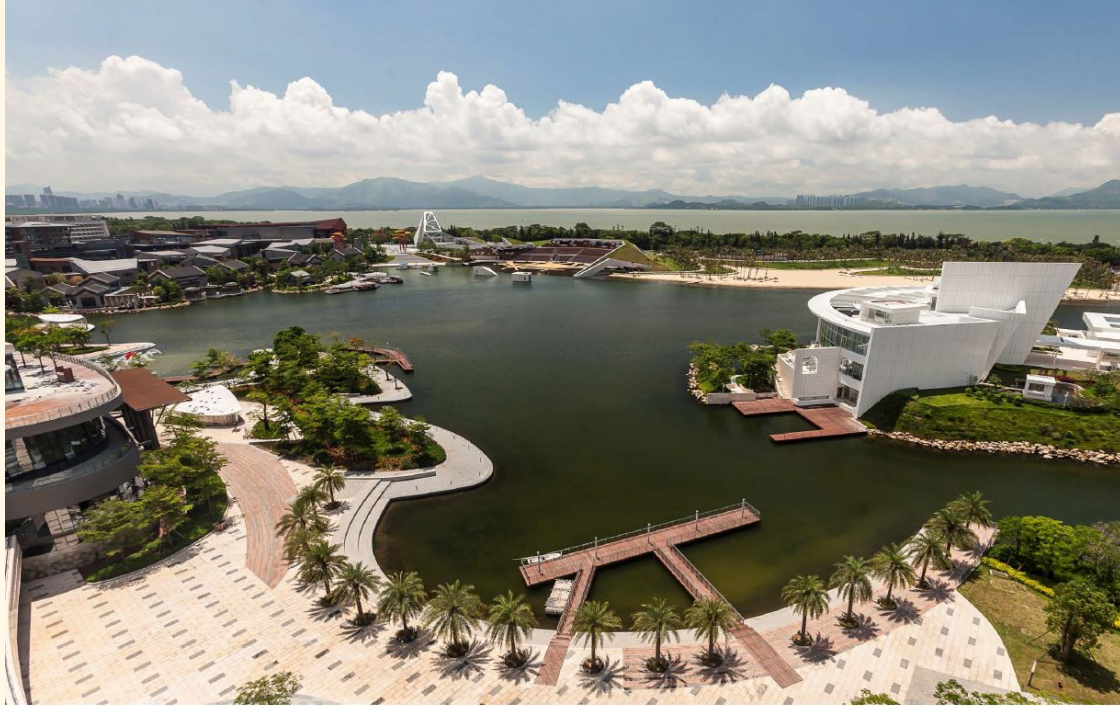
Thompson Image 5 OCT Bay

The master plan was designed to create publicly accessible programmed water front around the re-created lake with excursion boat docking, promenades, fountains and cafes. The man-made beach and green roof theater building can be seen in the background. Shenzhen Bay and the mountains of Hong Kong lie beyond.