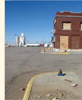
Schuessler Images 01 and 02 Greensburg Implementation Projects - Main Street

The master plan was designed to create publicly accessible programmed water front around the re-created lake with excursion boat docking, promenades, fountains and cafes. The man-made beach and green roof theater building can be seen in the background. Shenzhen Bay and the mountains of Hong Kong lie beyond.